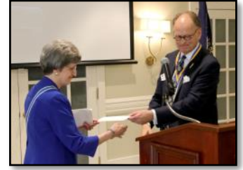
Check presentation for plaque replacement at Boonesborough