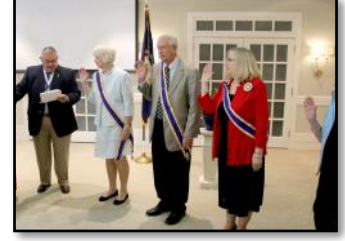
Officers being sworn in