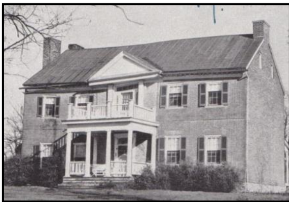
Federal Hill, Washington, KY