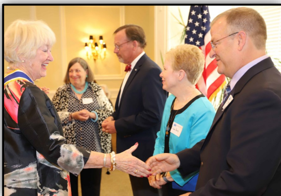
Governor General Hughes greets new members after their installation.