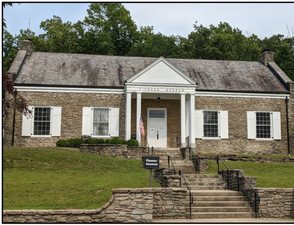
Pioneer Museum at Blue Licks Battlefield State Park